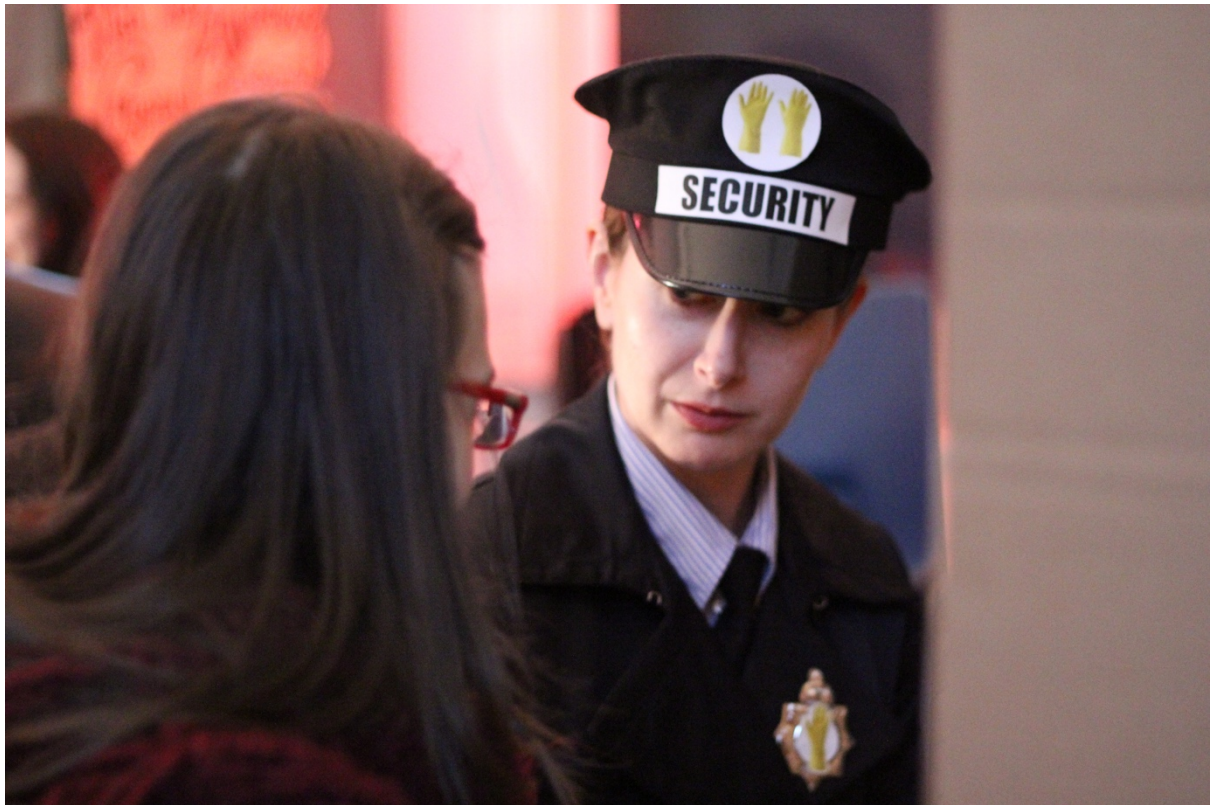
Security guard inspecting bystander's bag which ensues philosophical discussion of who owns thoughts.