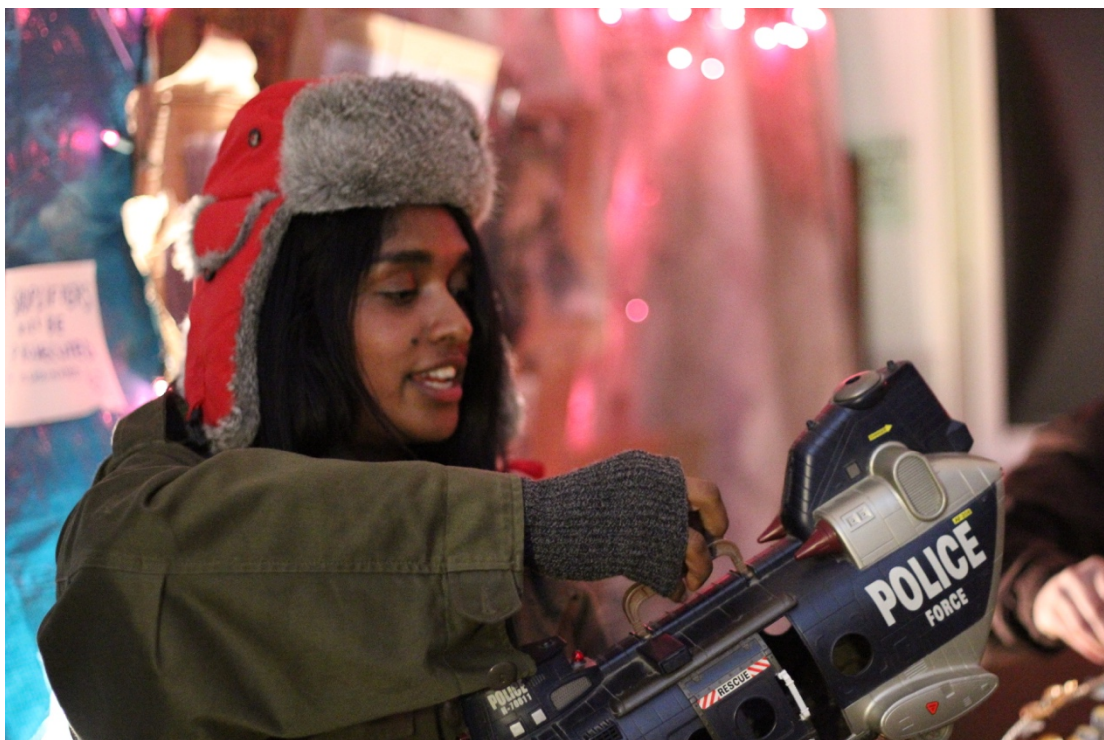
Market stall barter and trade for found treasure. What defines value?