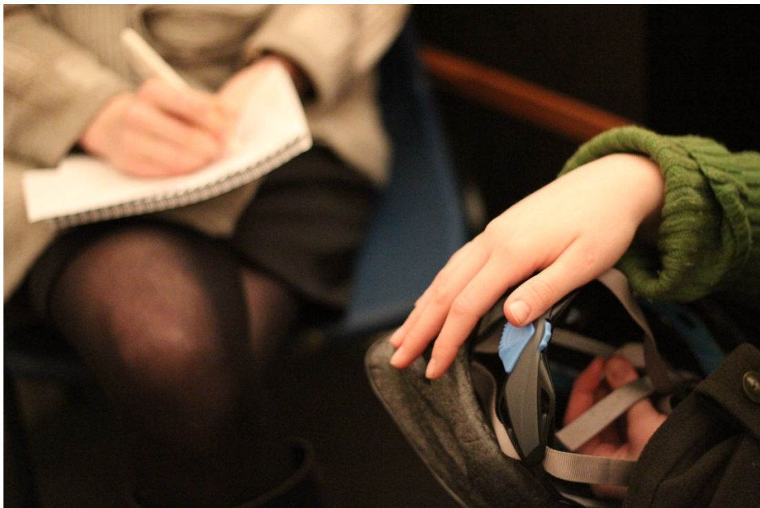
Debt counsellor service, making a plan for client to relieve her perceived debt to society for having middle class privilege.